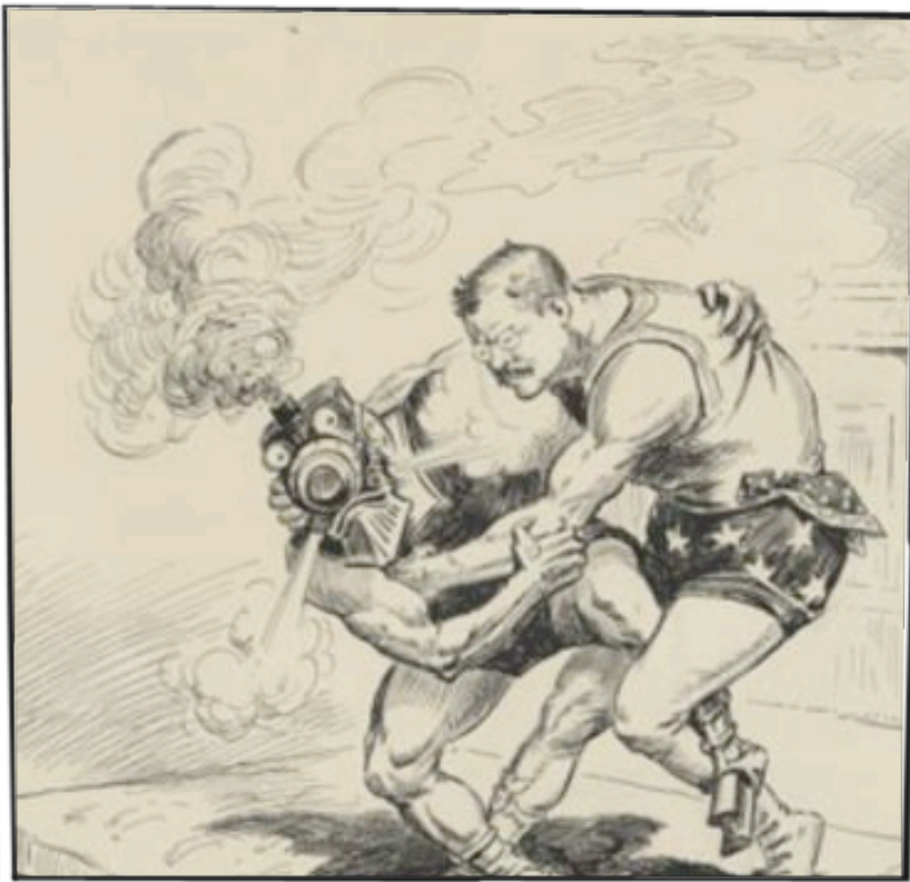
ROOSEVELT WRESTLES THE RAILROADS