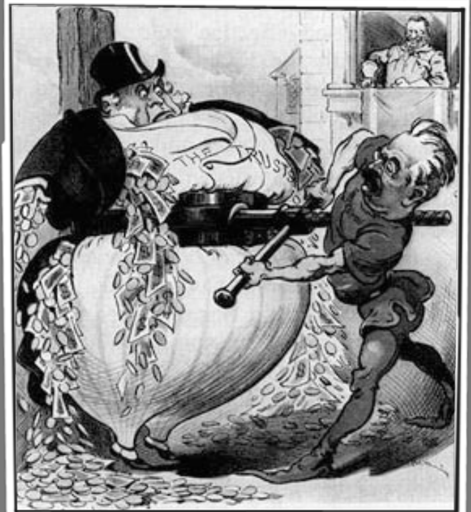
SQUEEZING THE TRUSTS