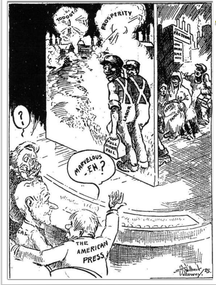
"It's Hard to Fool Those Backstage", The Pittsburgh Courier, (June 13, 1925)

The setting is a playhouse, with President Calvin Coolidge seated in the front row, accompanied by Uncle Sam and the American Press (media). They are watching a production of a day in the life of everyday Americans in the thriving 1920s economy. Workers happily drudge to work with smiles on their faces and Full dinner pails, while steel factories puff smoke and American production is humming. However, it is a facade, covering the reality behind the external signs of economic success. The reality hidden behind the facade is that of a struggling working class, lining the streets with little food, shelter, and clothing, while factories only hire "part time" labor at wages that are far below what it takes to live day to day.