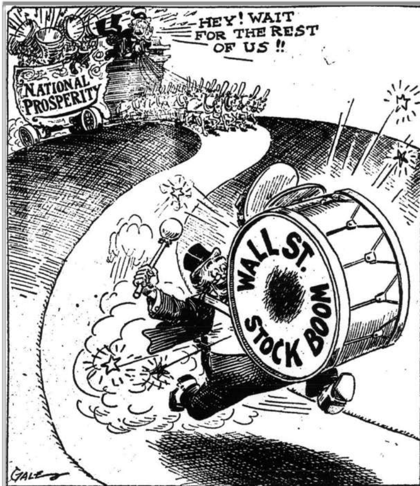
"Getting Ahead of the Bandwagon!", The Los Angeles Times, (November 24, 1928)